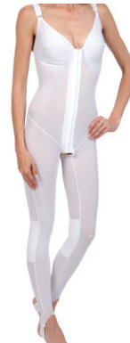
ANKLE-LENGTH WOMAN Ref. 011-C