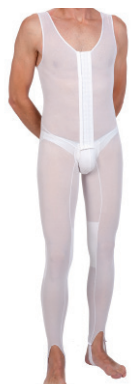
ANKLE-LENGTH MAN Ref. 014-C