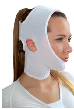
CHIN STRAP MASK Ref. 035-B