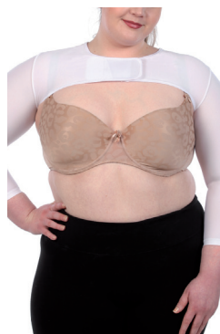
FRONT AND BACK-LINKED SLEEVES Ref. 037-6