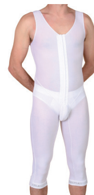
CALF-LENGTH MAN Ref. 014-B