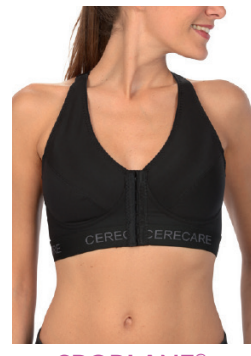
SPORLANE® Ref. 015 015-A (fitted stabiliser band) 015-B (removable stabiliser band)