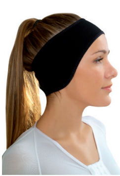
EAR BAND Ref. 036