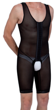
THIGH-LENGTH MAN Ref. 014-A