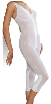
CALF-LENGTH WOMAN Ref. 011-B