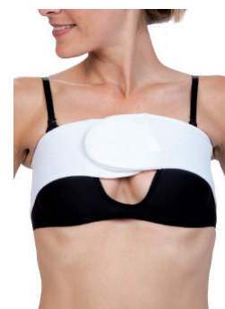
SINGLE BUST STABILISER BAND Ref. 033