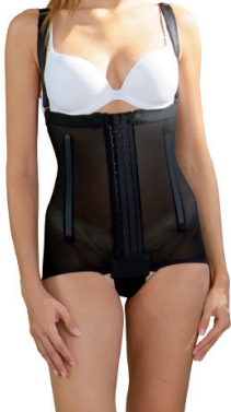
HIGH WAIST Front opening Ref. 020 (woman) Ref. 026 (man)