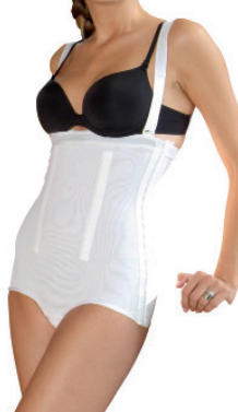
HIGH WAIST Side opening Ref. 019 (woman) Ref. 025 (man)