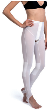
LOW-WAIST ANKLE-LENGTH Ref. 006