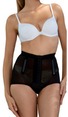
LOW WAIST Front opening Ref. 022 (woman) Ref. 028 (man)