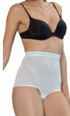
LOW WAIST Ref. 018 (woman) Ref. 024 (man)