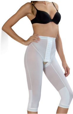
LOW-WAIST CALF-LENGTH Ref. 003