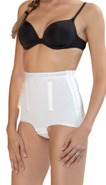
LOW WAIST Side opening Ref. 021 (woman) Ref. 027 (man)