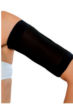
HALF SLEEVE Ref. 037-2