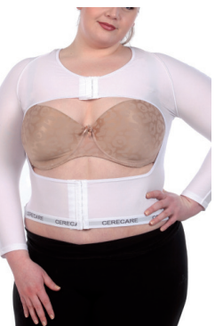
OPEN BUST VEST Ref. 037-4