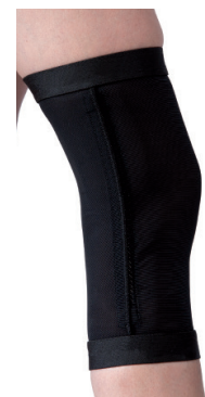
KNEE SUPPORT Ref. 040