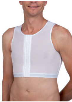
MAN BOLERO Ref. 039