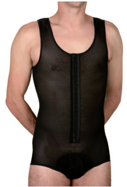
BODY MAN Ref. 013