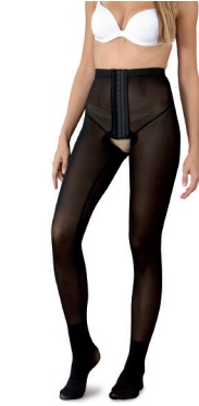
LOW-WAIST FOOT-LENGTH Ref. 008

007 & 008 models : only available with opened feet