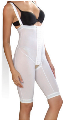
HIGH-WAIST THIGH-LENGTH Ref. 002