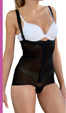
HIGH WAIST Ref. 017 (woman) Ref. 023 (man)