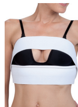
DOUBLE BUST STABILISER BAND Ref. 034