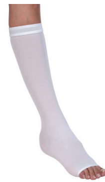
ANKLE SUPPORT Ref. 041