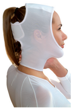
FACELIFT MASK Ref. 035-A