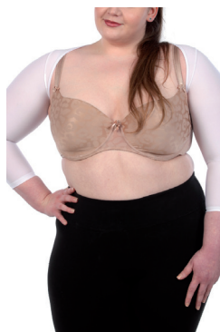
BACK-LINKED SLEEVES Ref. 037-5